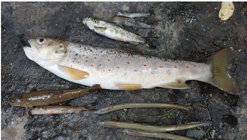
Fish kill event on the River Allow, Co. Cork in June 2018 (IFI, 2024)

River water temperature (RWT) is a critical environmental driver, shaping species survival, water quality, and overall freshwater ecosystem integrity. Cold-adapted species such as Atlantic salmon ( Salmo salar ) and brown trout ( Salmo trutta ) have evolved within narrow thermal niches, rendering them highly sensitive to even modest temperature increases. Recent years have already seen alarming fish kill events across Irish rivers, often coinciding with extreme climatic episodes, such as the 2018 heatwave, where water temperatures soared beyond the physiological thresholds for salmonid survival.