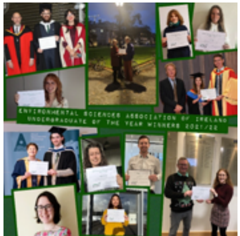
ESAI Undergraduate of the Year Winners