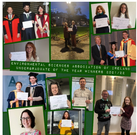
ESAI Undergraduate of the Year Winners